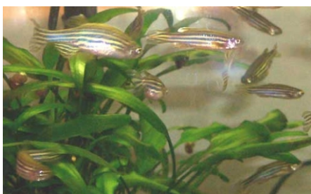
Zebra Fish (Danio rerio)

The PC runs on Windows 2000/XP. The bbe software contains all the components necessary to operate the bbe Toximeter. It provides a graphic control panel of the measured results with live, real-time pictures, offline viewing and an intuitive user interface. Fish tank, tubes and connectors are easily accessible at a low-maintenance level.