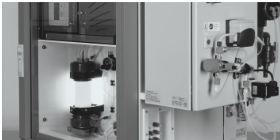
Toximeter with conditioner unit